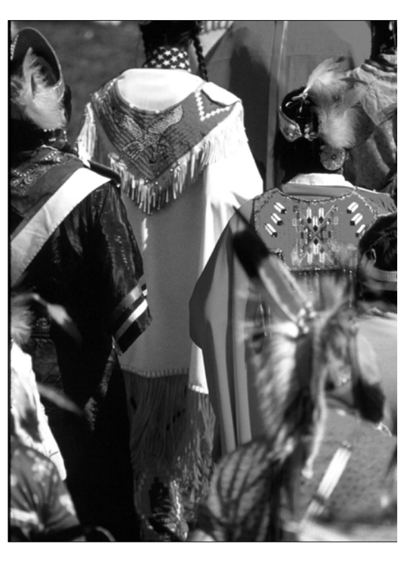
For You, Your Land, Your Community.